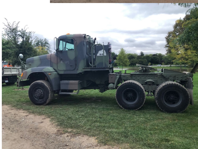
Before & After Pictures of the Truck Tractor