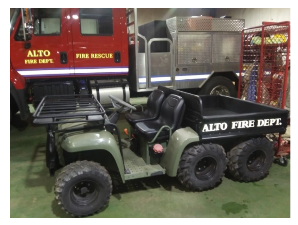
-Submitted by Megan Sim, Texas SASP

The City of Alto Fire Department received this John Deere Gator 6x4 vehicle from the Texas SASP in April 2020. The Gator was in good shape when it arrived at the Texas SASP from U.S. Customs & Border Patrol in El Paso, TX. The original government acquisition cost was $11,000. The service charge paid by the City was $1,500 for a total savings of $9,500 compared to buying new!