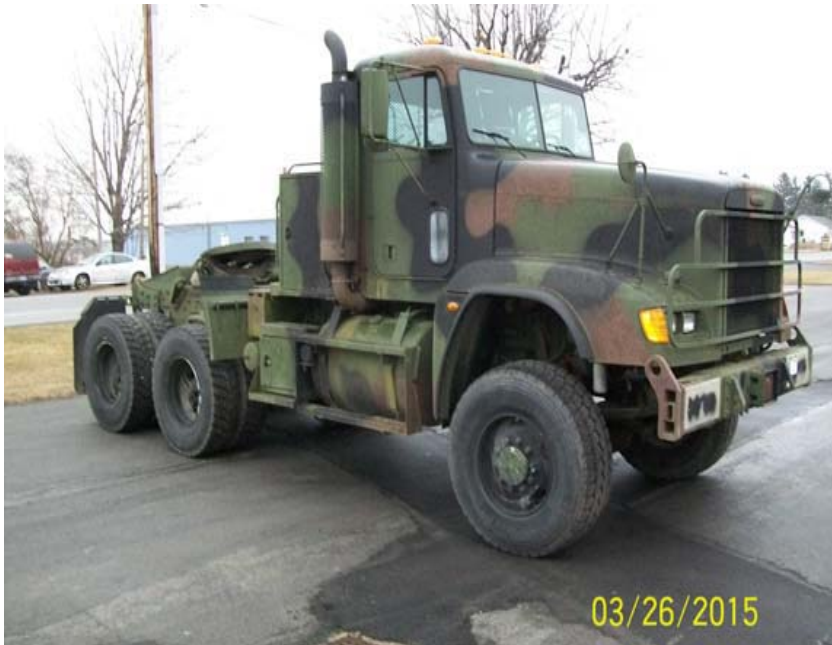
Before (above) and After (below) pictures of a truck acquired by the Grady County Fire Dept., Grady County Oklahoma