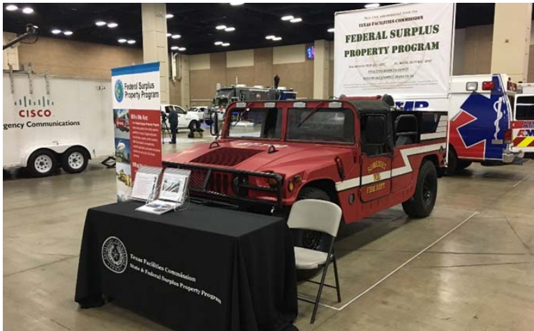
Above :Somerset Vol Fire Department's Humvee