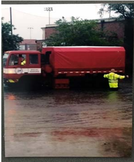
Below: City of West University Place's LMTV Truck