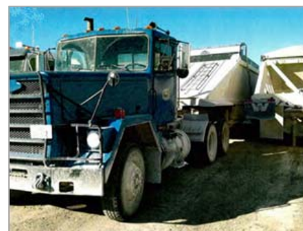
AMC General Truck used to pull belly dump trailer