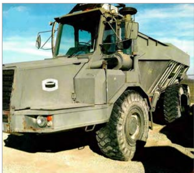
Moxy Off-road 6x6 Truck now used to haul gravel. It has been very handy during recent flooding.