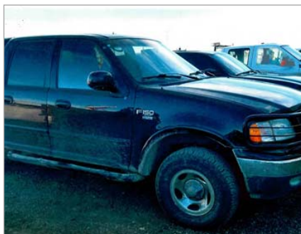
Ford 4x4 Pickup Truck with low mileage that replaced a very high mileage non-4WD pickup