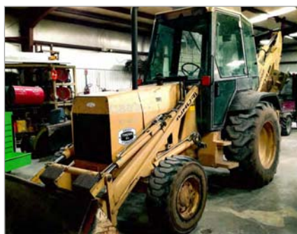
Ford Backhoe 4x4 used in daily digging. During the flooding, thumb attachment was added to clean out debris from culverts.