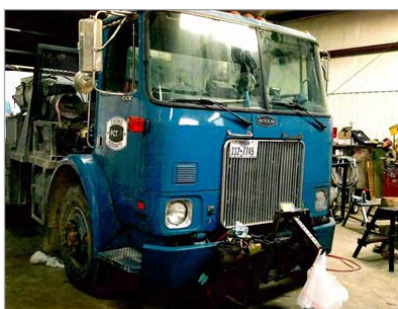
Auto-hauler Truck that was converted into welding truck. It is in the shop getting a snow plow mounted acquired from Federal Surplus recently.