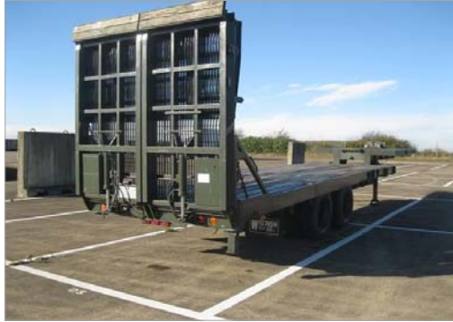
Original gov't acquisition cost = $16,653 Handling fee paid by donee = $10,000