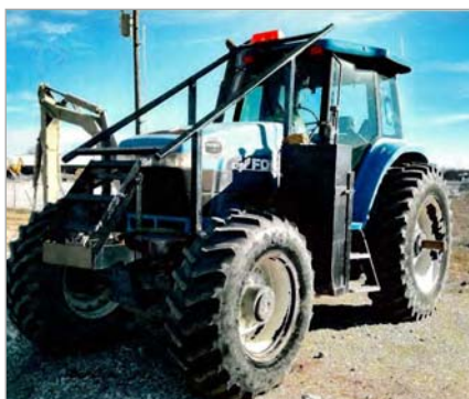
Ford Tractor 4x4 190HP is used to operate side boom mower and to tow packer units (also from surplus property)