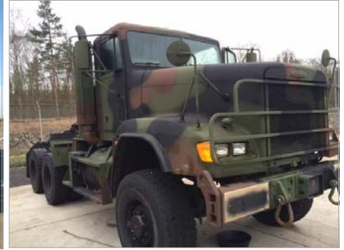
Original gov't acquisition cost = $166,223 Handling fee paid by donee = $16,160

Indiana Dept of Transportation saved a total of $217,454 on these three pieces of equipment.