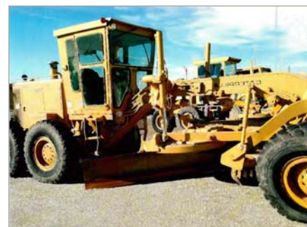
Caterpillar 130 Grader used to maintain roadways