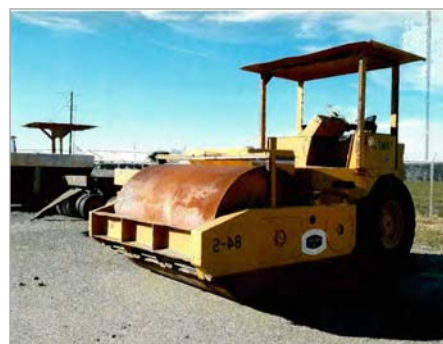
Vibratory packer used in building and maintains roadways