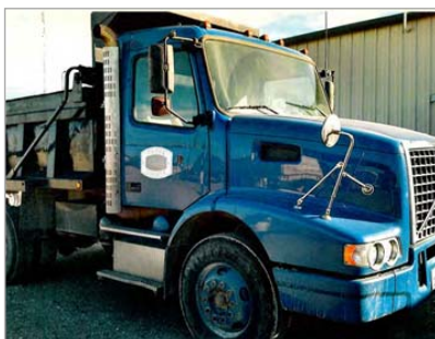
Added a dump bed to this Volvo Truck so it can pull a trailer for hauling skid loader and small tractors.