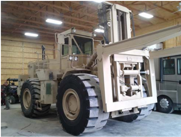
Before picture (above) of the item prior to modifications.

A Nebraska SBA 8(a) participant, BY Excavating, received a Caterpillar 988B Container Handler/Lifter from Ft. Riley through the Nebraska SASP for a service charge of $20,000. The Donee then spent an additional $30,000 to make some modifications to the machine including adding a front end loader. With a total of $50,000 invested, the Donee saved over $100,000 since now this piece of equipment is worth well over $150,000.