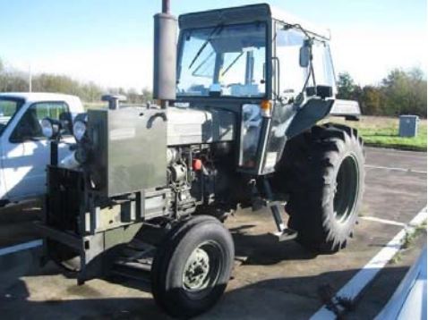
Original gov't acquisition cost = $70,738 Handling fee paid by donee = $10,000