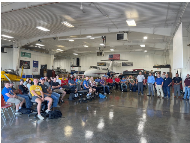
1st Day of Class 2022