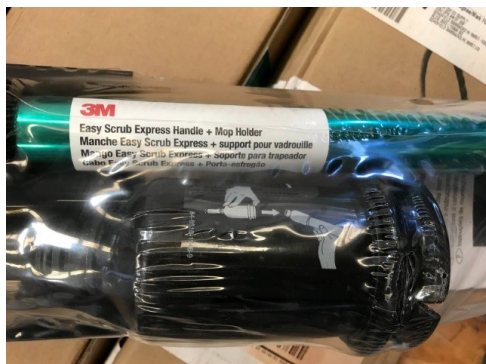
Flat Mop Tool