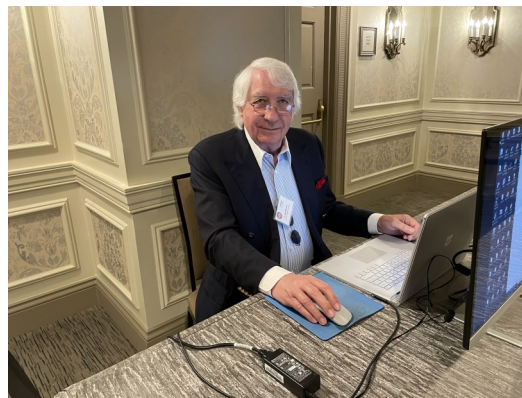
Surplus Property Software

Not pictured: Compass Auctions & Real Estate