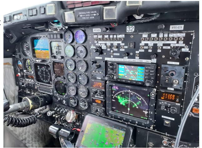
Here's how the instrument panel looks when you are cruising at 8000 feet and 325 knots!