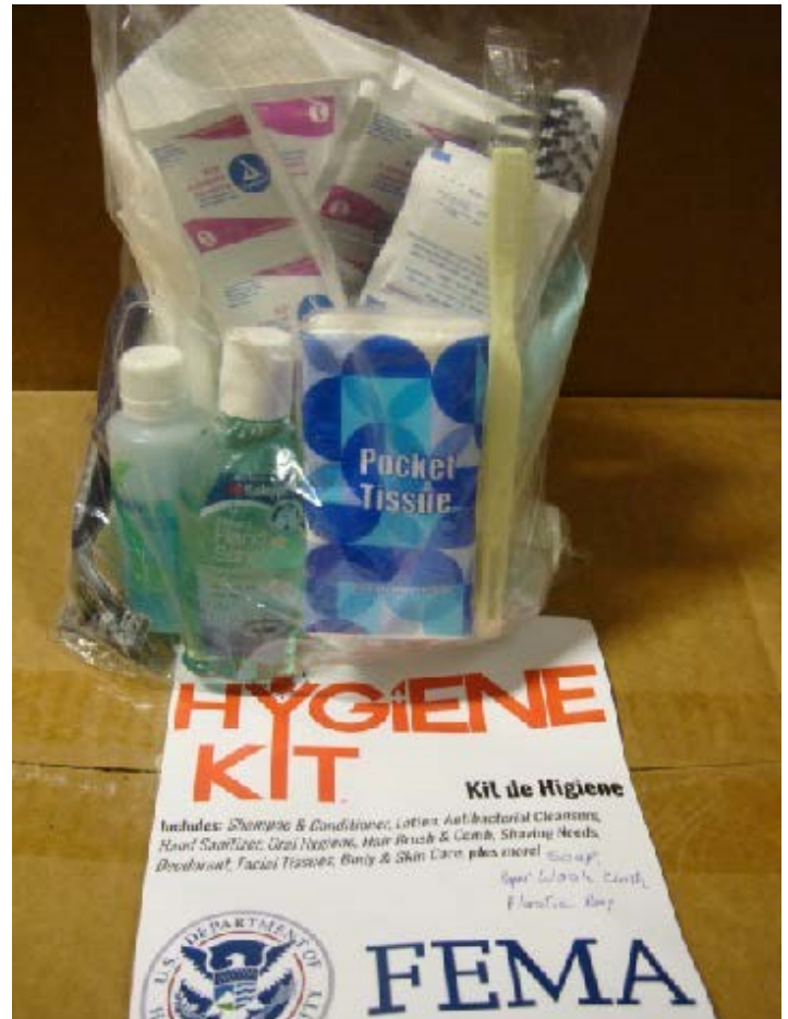
New Life Evangelistic Center acquired thousands of hygiene kits that were used to help the homeless in St. Louis and Springfield.