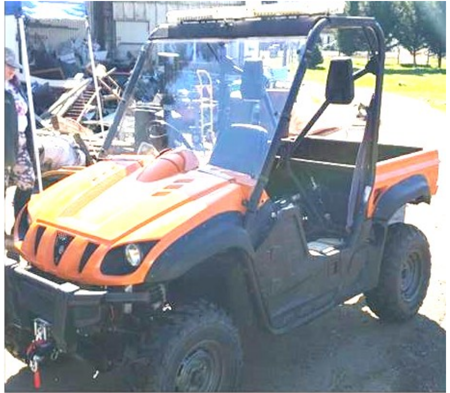
Before (above) & After (right) pictures of the Yamaha Rhino UTV