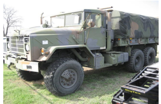
"Before" picture of the truck prior to the donation