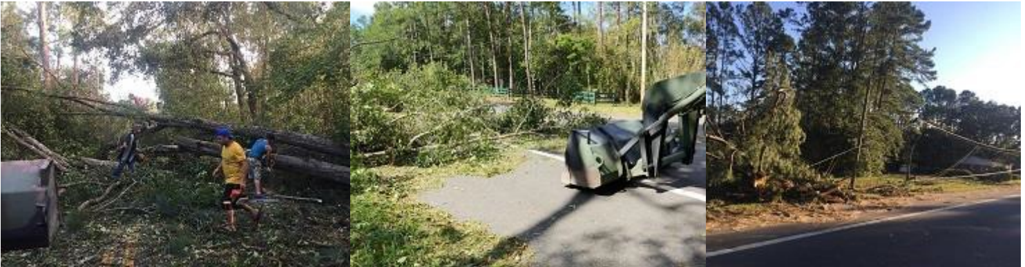
Above—Museum equipment being used to clear debris left from hurricane Below—Patrol River Boat in the Perry Forest Festival Parade & Exhibition

So, that is an update on what has been going on, and to also say thank you for all the assistance you have provided. THANK YOU!!