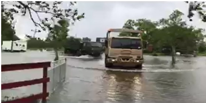
Brazoria County – A National Guard truck is being pulled by a LMTV truck that had been donated through the Texas SASP. The LMTV cargo trucks proved to be invaluable to the rescue efforts, and in many cases, were the only vehicles able to navigate the high waters in the affected areas.

We certainly could not have done this alone, and this cooperation is a testament to the great things that can be accomplished with a little teamwork.