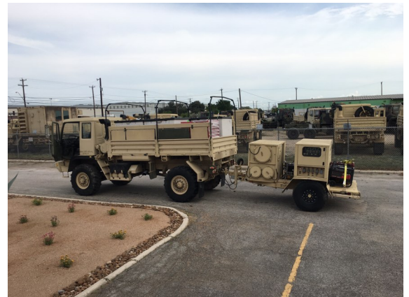
Donation from the Texas SASP's San Antonio Warehouse to Travis County Emergency Service District #1 which included cots, tools, cargo truck, and generators.