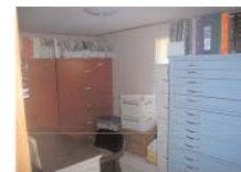
Supervisor's Office/ Map/leing Office