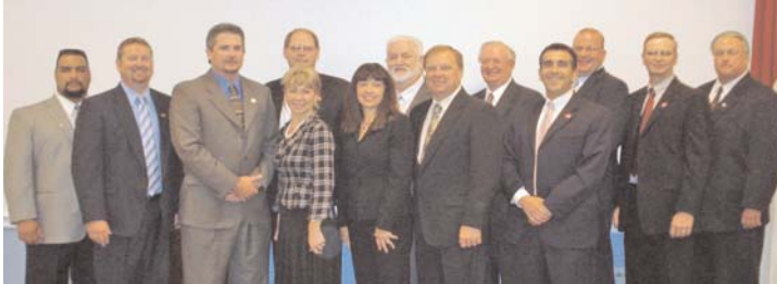
Pictured are donee and NASASP representatives who attended the Congressional breakfast