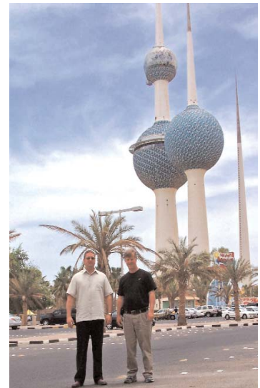
The three towers were built for multi-purpose operations. The needle shaped tower provides electricity to the suburbs in Kuwait. One tower stores up to one million gallons of water. The towers were damaged heavily by the Iraqis during their occupation of Kuwait from 1990 to 1991.

Congress recently changed the program so private companies could obtain the surplus items and then sell them back to local governments and make a profit. That, Turney said, not only raised the price of the items, but it also had taxpayers paying for the same thing twice. "It already belongs to the taxpayers. Why should somebody be able to make a profit off of what's the taxpayers' already?" he said. The program was set up so that state and local governments could acquire surplus equipment from the federal government for free. All they would need to pay is shipping and handling fees. That allowed Turney to purchase several trucks for the fire department at a greatly reduced price. As an example, an ambulance that normally would have cost $100,000 coming to Hereford for $20,000. The truck was in Germany and had only 4,000 miles on it. After shipping it here and having it repainted and outfitted, it cost the department $80,000 LESS than if it had been purchased new. "They let agencies sell to dealers up front for cash with no oversight to where the money goes," Turney said. "The Congressmen are looking at legislation to get this stopped!"