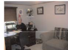
Town Manager's Office