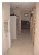
Hallway with fileing cabinets